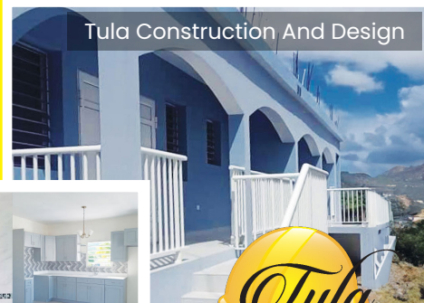
Tula Construction And Design

Interviews With St. Maarten's Best Developers, Builders And Construction-Related Businesses