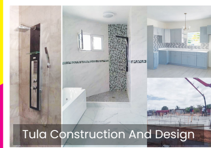
Tula Construction And Design